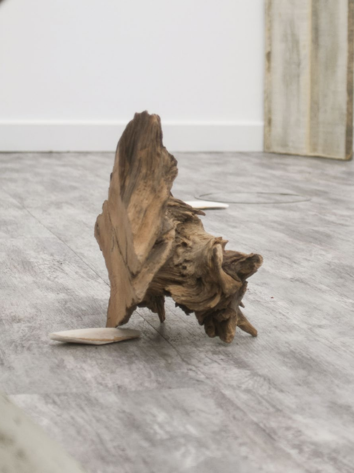
Low Frequency Stratum 2017 wood and cuttlefish bones dimensions variable