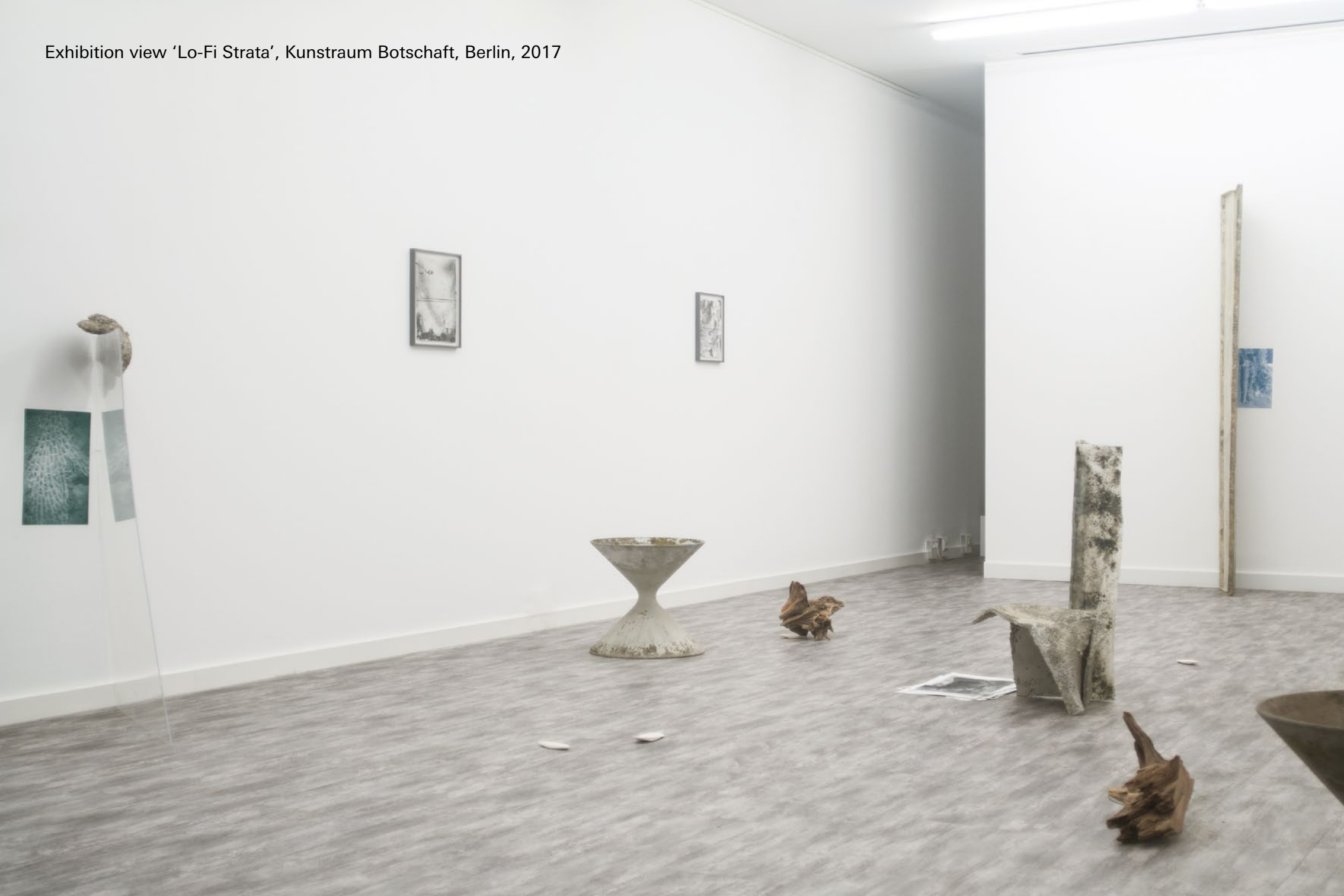
Exhibition view 'Lo-Fi Strata', Kunstraum Botschaft, Berlin, 2017